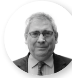
Mark Latham Strategist